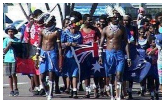
Mabo Day Celebrations in Townsville, QLD 2011 see: http://www.abc.net.au/local/videos/2011/06/03/3235188.htm

Background information about the landmark Yorta Yorta case can be found on the SLV site here . More comprehensive information about the Yorta Yorta Struggle for Land Justice can be found on the On Country Learning Course Wordpress site.